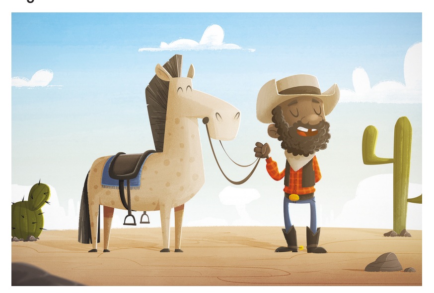
A cowboy with his horse

A long time ago, there were lots of cowboys in North America. Some were young and some were old; most were men and very few were women. They rode horses and looked after cows.