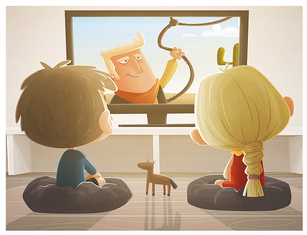
There are many films about cowboys.

In real life, cowboys were often quite old. They were covered in dust and had little time to wash or shave. Usually their horses were more handsome than they were!